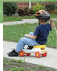
The Lighthouse accommodates 20 women and up to 26 children.