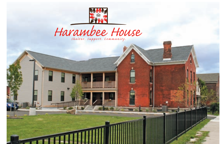
Harambee House is a residence for individuals with mental illnesses who have been chronically homeless.